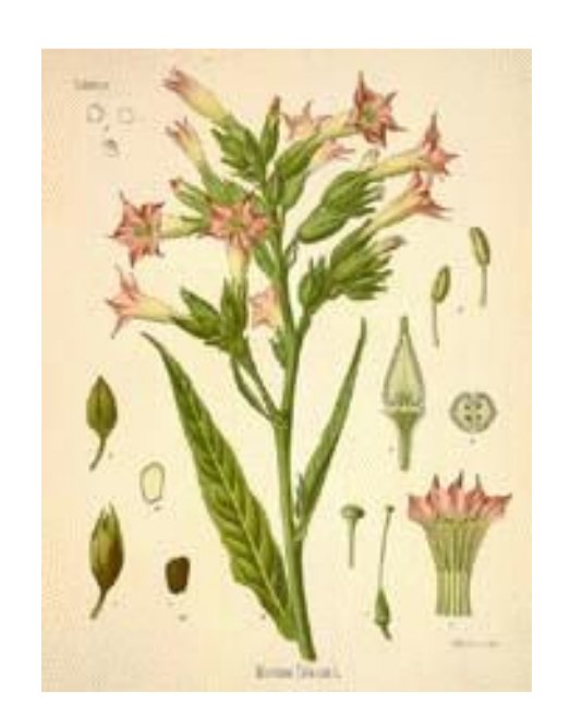
Cultivated Tobacco (Nicotiana tabacum.)

1.3.2 Habitat: Virginia, America; and cultivated with other species in China, Turkey, Greece, Holland, France, Germany and most subtropical countries.